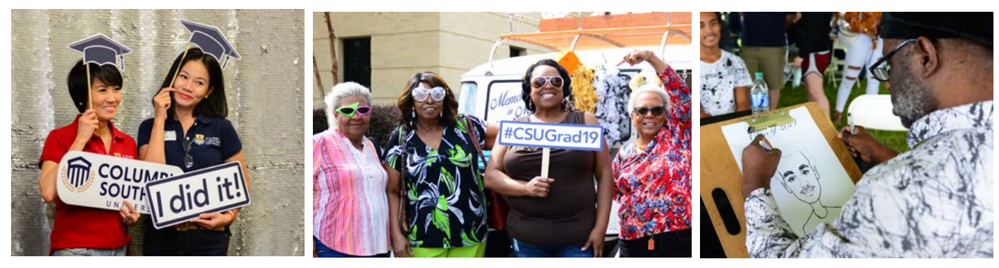
Our 2019 graduates and their guests gathered last October to celebrate together.

To find a regional alumni chapter near you, visit ColumbiaSouthern.edu/Alumni/Alumni-Chapters.